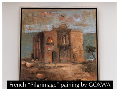
French "Pilgrimage" painting by GOXWA